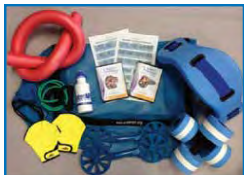
Aqua Fitness Exercise kit

Swim tank cardio SunTan - superman exercise